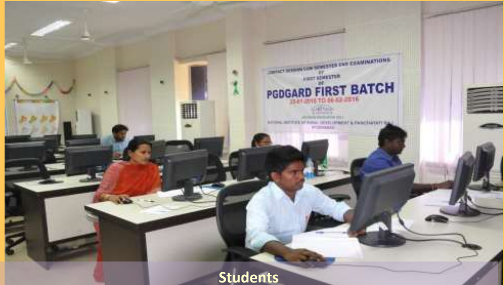
Students of PGD GARD First Batch attending their Lab Practices session at CGARD, N

The Programme would broadly cover the tools and application techniques of GIS, Remote Sensing, GPS and details of related software and dataproducts specific to spatial datamining, planning, monitoring, decision making and modelling of various programmes and